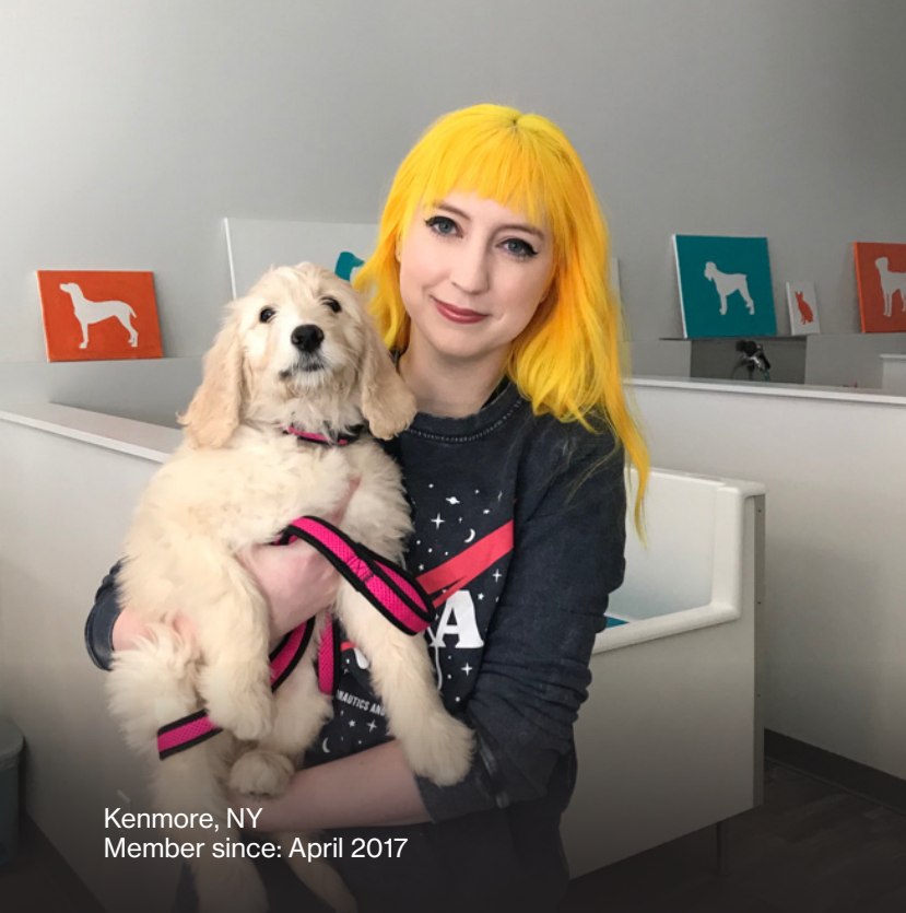
Kenmore, NY Member since: April 2017